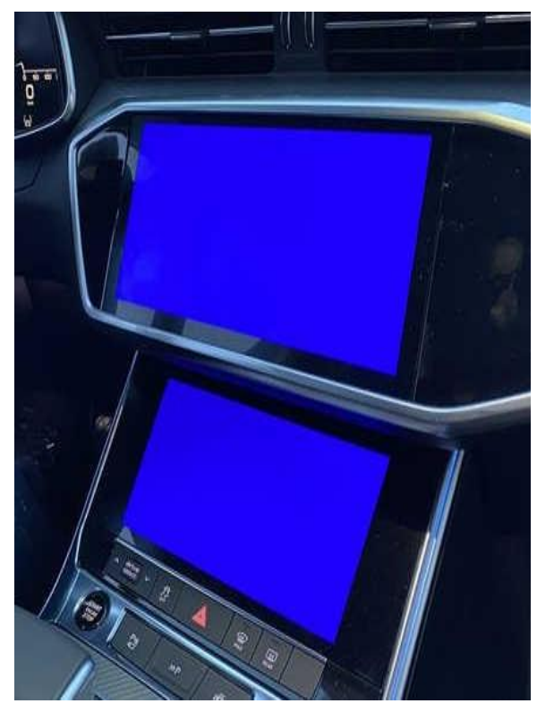
Figure 1. Dual screen vehicle.

The MMI display turns completely blue (Figures 1 - 2).