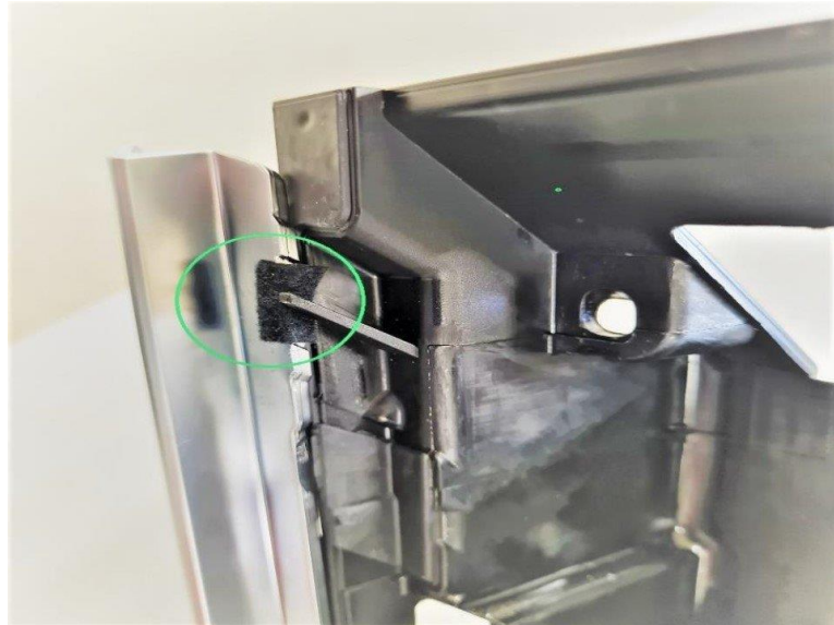
Figure 2. Felt tape applied between the rib of the display mount and the trim frame.