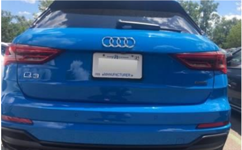
Figure 2. The rear license plate successfully installed on the new Q3.