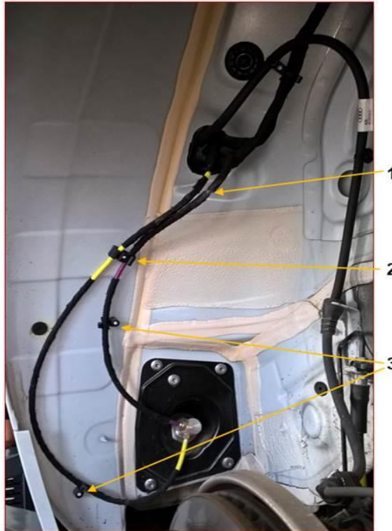
Figure 2. Area to be reworked.