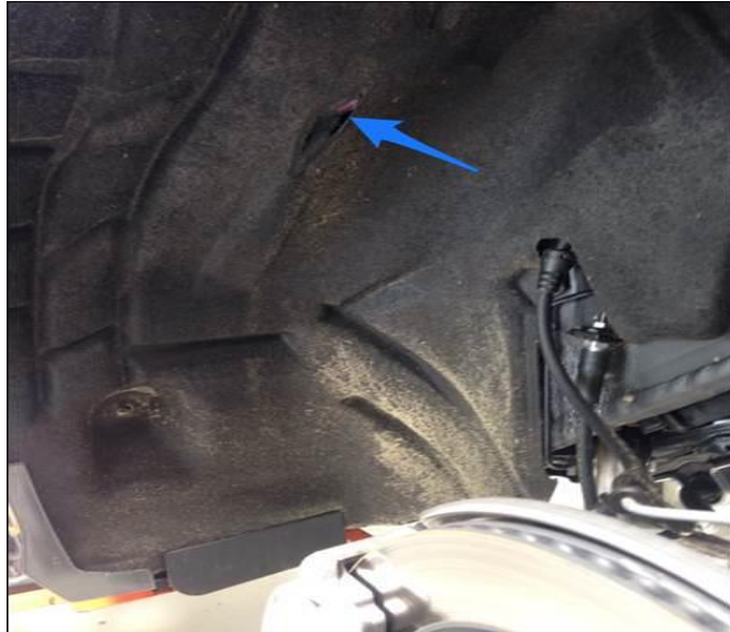
Figure 1. Area of possible irregularities.