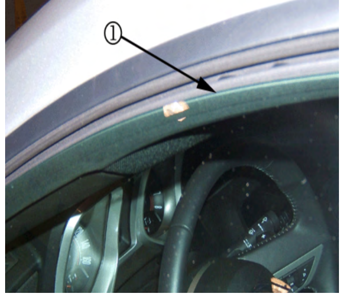
Window in "Indexed" Position (1) (When Door Latch is Opened)