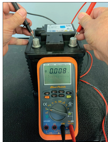
Figure 2 – Voltage test indicating an open connector