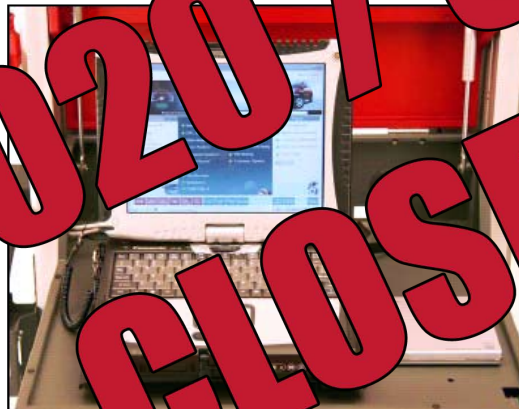
Global Diagnostic System (GDS)

It is recommended that any vehicle within this production range be repaired prior to retail sale to a customer.