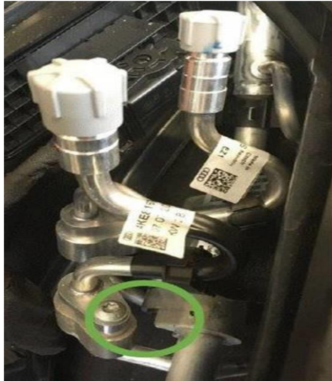
Figure 5. The refrigerant lines have been separated.

4. Figure 5 shows properly separated refrigerant lines.