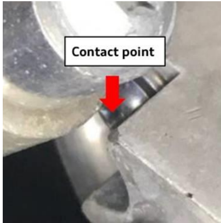
Figure 3. Point of contact.