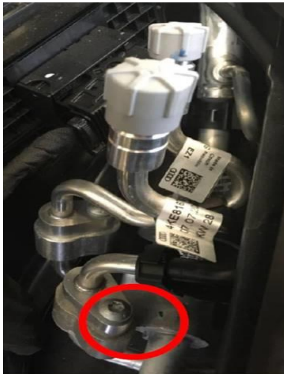
Figure 2. The refrigerant lines are making contact.