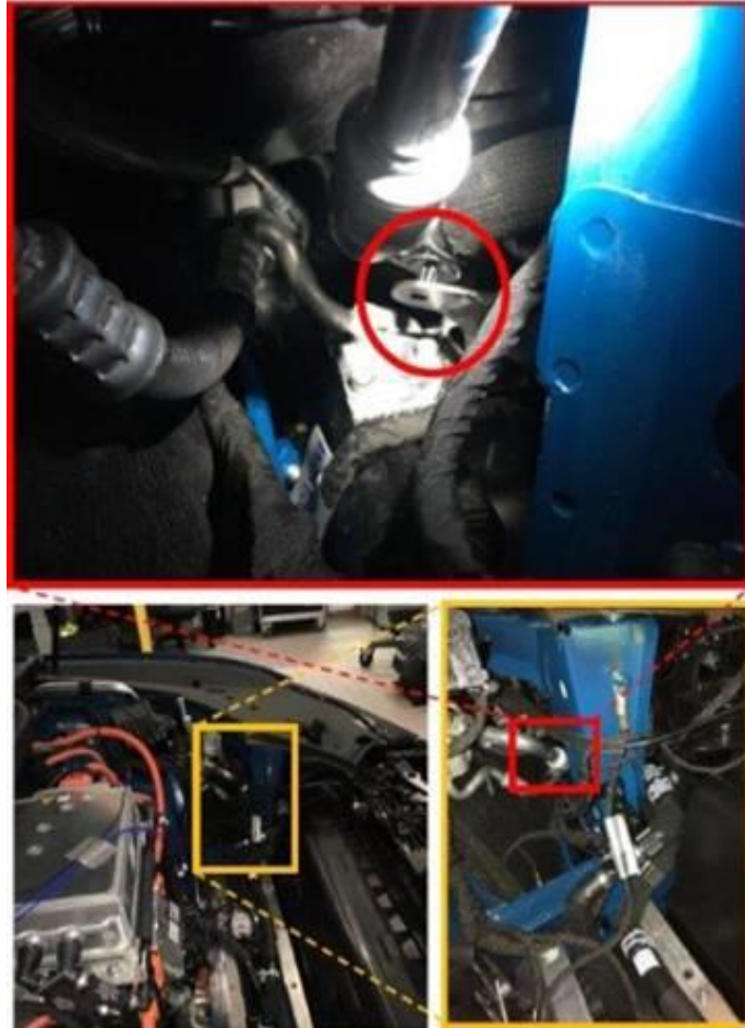
Figure 4. The area in the motor bay where contacting lines are located.