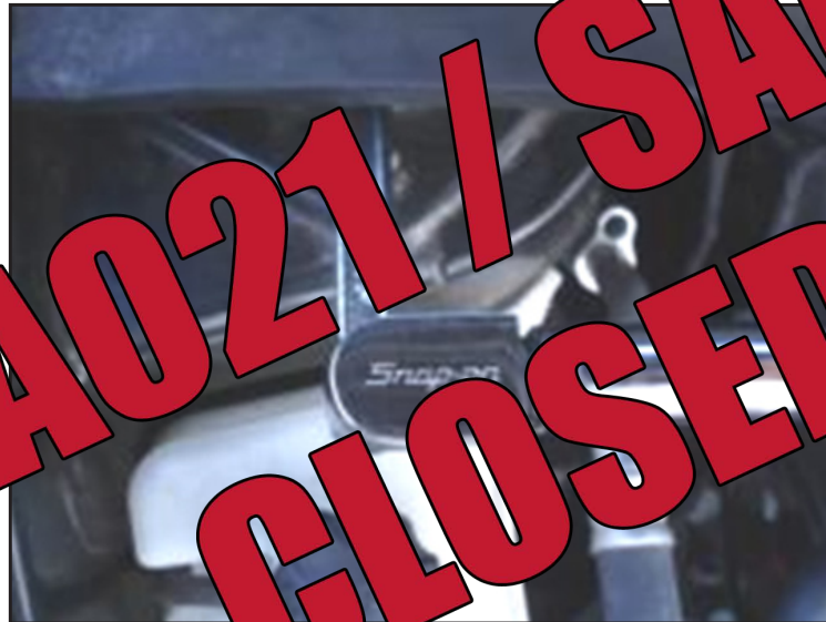
Front strut upper nut tightening procedure

This bulletin provides information relating to some 2009MY Rondo (UN) vehicles built between April 9, 2009 ~ July 16, 2009. While driving on an uneven road, some vehicles may experience abnormal noise originating from the upper area of the front strut. To correct this condition, use a 1/2" drive torque wrench and the 6" torque adapter tool to retighten the front strut upper nut (with the upper nut locking) on both sides to specified torque specification.