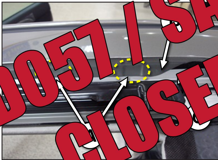
The noise occurs due to interference between sunroof rail (C) and recessed areas (A) of roof panel (B).

To improve customer satisfaction, Kia is requesting the completion of this Service Action on all affected 2010 Forte Koup (TD) vehicles in dealer stock.