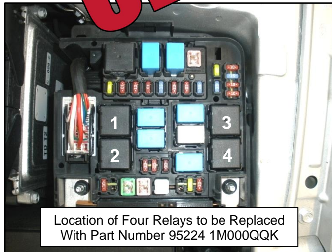
Location of Four Relays to be Replaced With Part Number 95224 1M000QQK