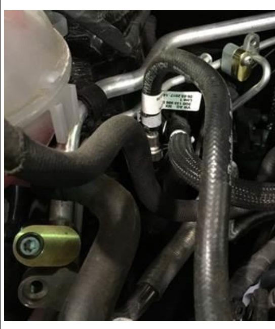
Figure 4b. Installation of Low side rear A/C Line connection block adaptor VAS 6338/5