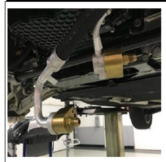
Figure 6. Installation of VAS 6338/3 and 6338/12.

10. Disconnect A/C compressor hoses from the compressor.