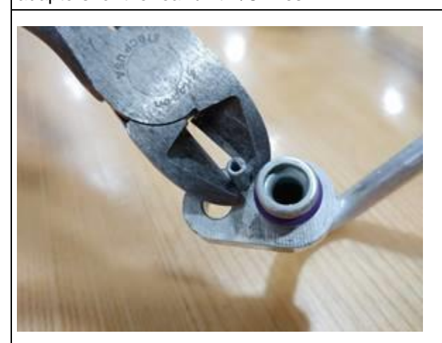
Figure 15. Removal of dowel pin.