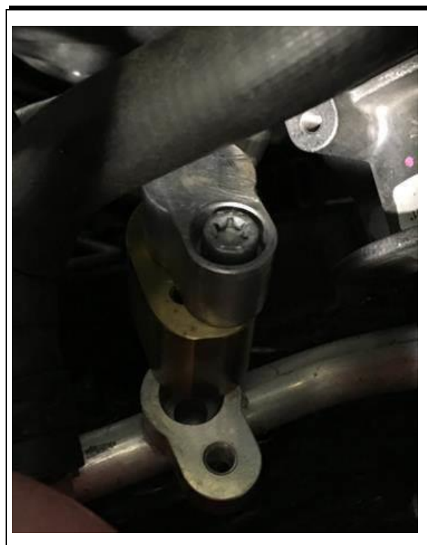
Figure 14. Location and connection of the adaptors for the rear unit A/C lines