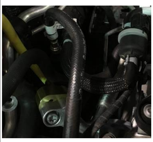
Figure 17. Attaching service station and flush hoses to rear A/C lines.

27. Perform an extended 3 cycle flush on the rear A/C unit.