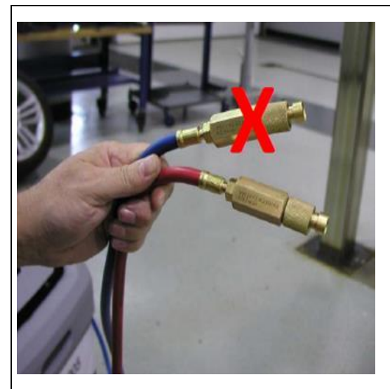
Figure 5. A.C hose adaptor 6338/44

9. Remove A/C Recovery machine high side coupler from hose.