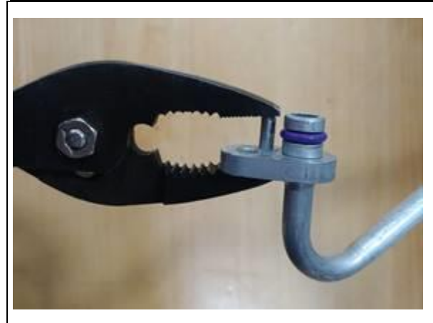
Figure 16. Installation of rear refrigerant line dowel pin.