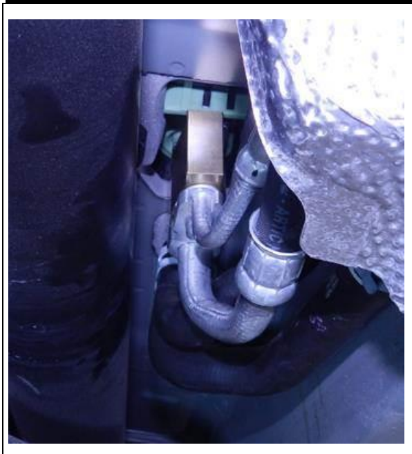
Figure 13. Location of rear air conditioning unit expansion valve.

23. Remove rear expansion valve and install VAS6338/38 as shown (Figure 13).