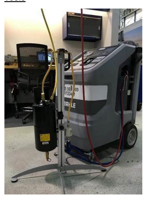
Figure 1. The VAS581005 Air Conditioning Service System with Flushing Device.

Use an approved R1234yf servicing machine and the R1234yf Flush Kit RTI360831840 (Figure 1).