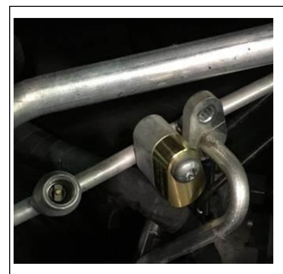
Figure 4a. Installation of high side rear A/C Line connection block adaptor VAS 6338/63

7. Remove expansion valve and install flush plate VAS 6338/38 (Figure 3).