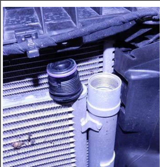
Figure 2. Location of the Receiver Drier

When removing front grille ensure ignition is switched OFF and negative battery cable is disconnected before disconnecting the front distance regulation module.