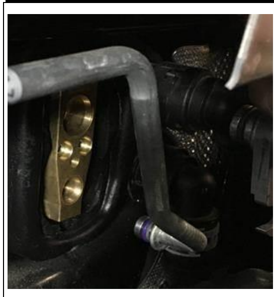
Figure 3. Installation of front expansion valve bypass adaptor VAS 6338/38.

7. Remove expansion valve and install flush plate VAS 6338/38 (Figure 3).