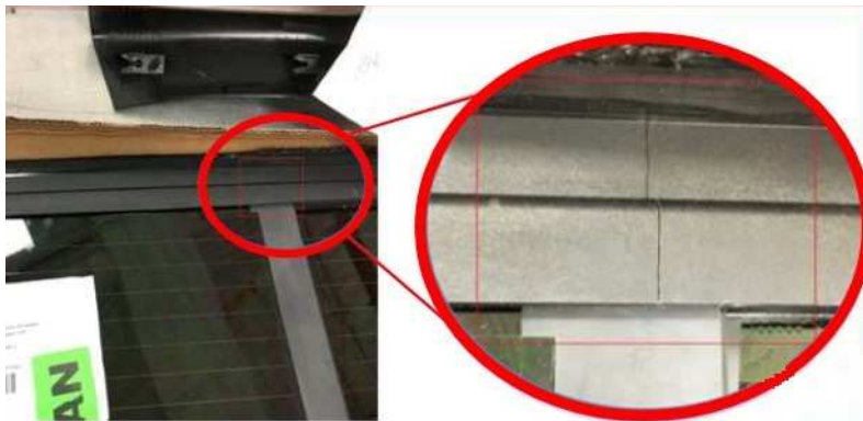
Fig. 2 Cracks In Backlite Upper Frame