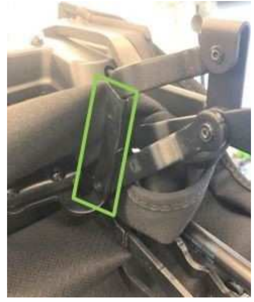
Fig. 2 Frame Side Link To Clean And Apply Tape