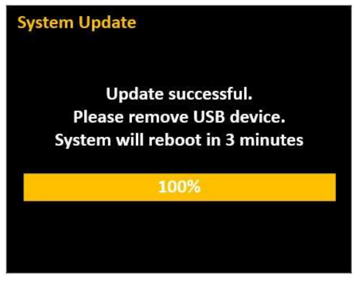
Fig. 5 Update Successful Screen

12. After the update is done the screen will display "Update successful" see (Fig. 5).