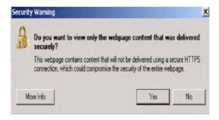
Fig. 1 Pop-up Security Message

3. If a security message appears "Do you want to view only the web page content that was delivered securely?" (Fig. 1) Press 'No' to continue.