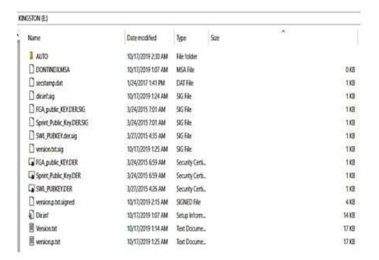
Fig. 3 Files On USB Flash Drive

6. Download extracted file to blank USB flash drive (Fig. 3).