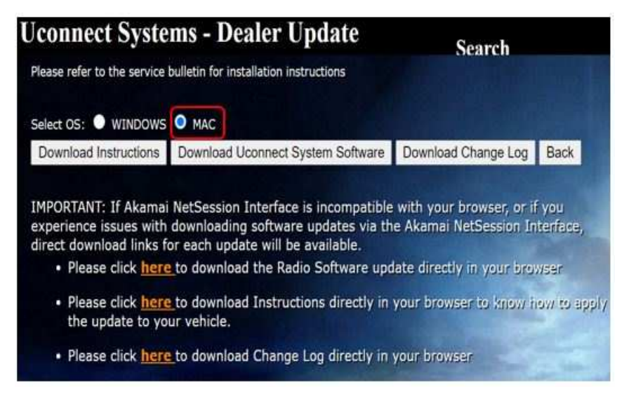
Fig. 2 MAC Download

4. Download the software update file to your local PC's desktop. Make sure to select the "MAC" radial button for all downloads (Fig. 2) .