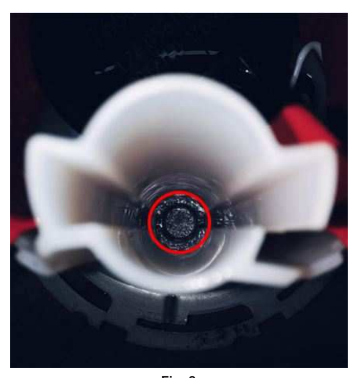
Fig. 2 DEF Crystallization Buildup In Level Sensor Focus Tube

NOTE: Do NOT clean DEF system components using regular tap water. The mineral content in tap water can cause issues with the system. Only use fresh DEF fluid, or warm, distilled water to clean crystallization from the DEF components.