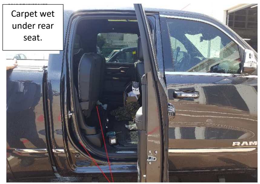
Inspection area for water entry rear cabin wall.

Sunroof drain tubes, connections and grommets should be inspected for kinks, and proper attachment for all 4 tubes.