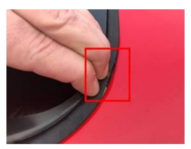
Figure 7. Adhesive band detachment.