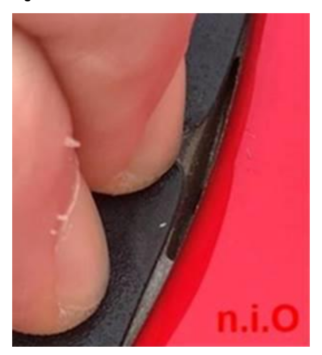
Figure 8. Close-up view of the detachment area from Figure 7.

8. The locations where the adhesion is compromised or has failed is a possible entry point for water into the cabin. The area directly below these openings is outside the area of the sunroof drainage. If any adhesion is found to be compromised or failed to any extent replace the sunroof opening perimeter seal. Follow the procedure in ElsaPro explicitly to ensure proper seal adhesion paying particularly close attention to the adhesion surface preparation.