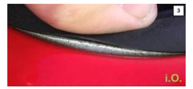
Figure 3. A properly adhered perimeter seal.

3. Figure 3 shows a properly adhered adhesive band.