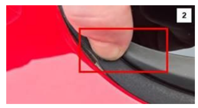
Figure 5. Clear evidence of adhesive detachment.

Figures 5 – 8 clearly show that the adhesive tape has come loose from the vehicle body. The obvious color and shape difference at the point of contact revealing the gaps is evidence of detachment.