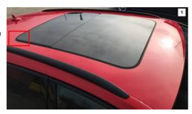
Figure 4. Begin inspection of the rear portion of the perimeter seal.

5. Using the same inspection principle used in the inspection of the front portion of the sunroof opening perimeter seal check the seal adhesion in the rear portion of the sunroof opening (Figure 4).