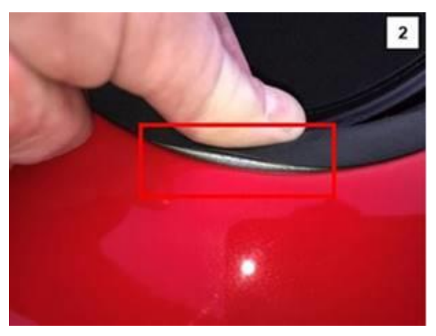
Figure 2. Checking the adhesion quality.

Press the seal downwards and inwards with your fingers until the adhesive tape for the seal is visible (Figure 2). The foam adhesive tape may be stretched but it must not be loose or detached from the roof panel to any degree.