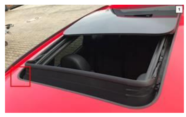
Figure 1. Front sunroof panel open.

1. Begin the inspection of the sunroof opening perimeter seal adhesion by fully opening the front sunroof glass panel (Figure 1).