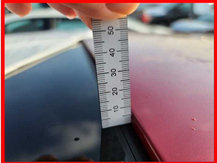
8 mm Height Difference Shown Below