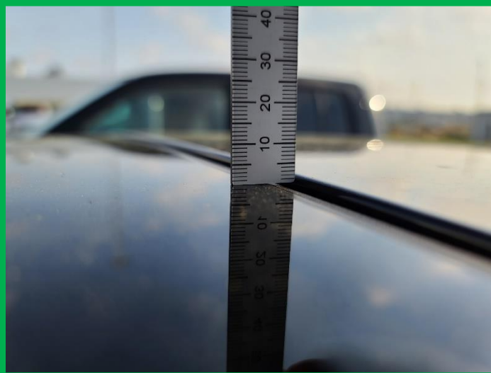
2 mm Height Difference Shown Below