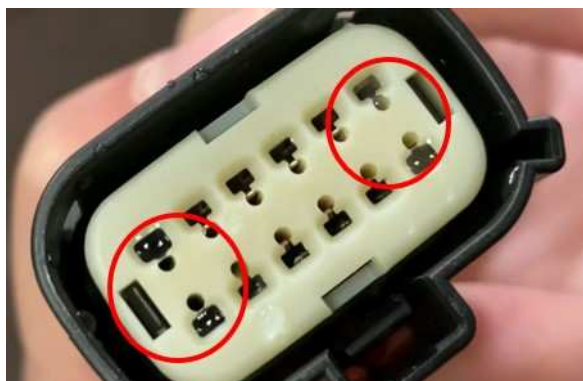
Fig. 1 Water On Terminals

NOTE: The above condition is caused by water intrusion ( Fig. 1 ).