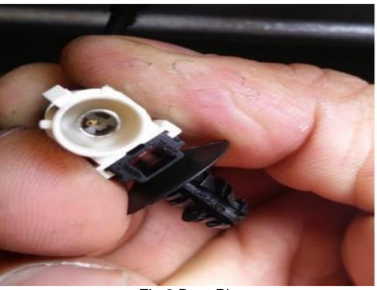
Fig 2 Bent Pin