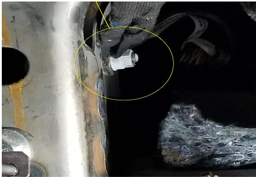
Driver side behind BCM, Grounds G021PA, G021PB

This document does not authorize warranty repairs. This communication documents a record of past experiences. STAR Online does not provide any conclusions about what is wrong with the vehicle. Rather, it captures all previous cases known that appear to be similar or related to the vehicle symptom / condition. You are the expert, and you are responsible for deciding on the appropriate course of action.