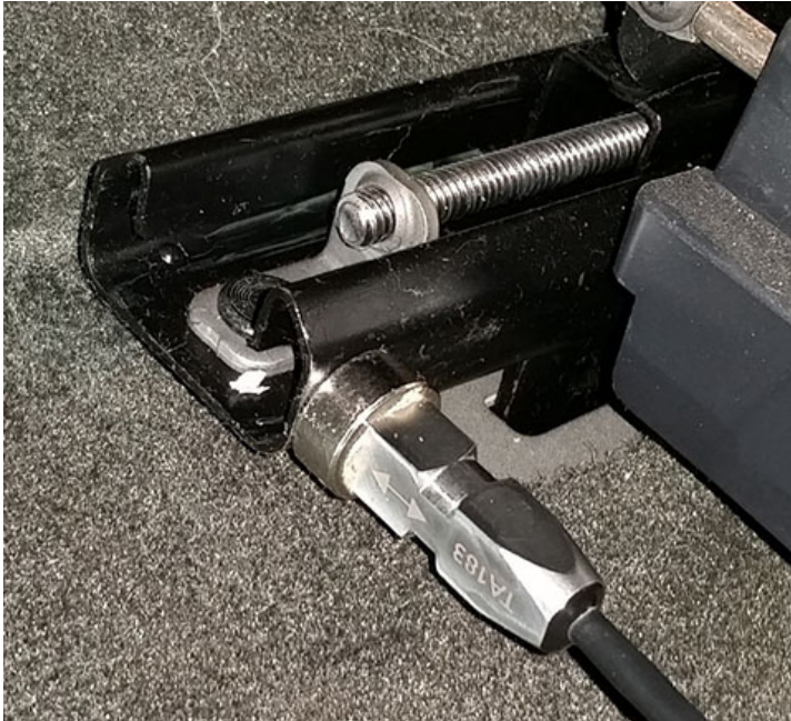
(TA183 single axis pico sensor shown / TA143 is tri-axis sensor)

Add E1.5 to the displayed data and turn Off T and P related data (under Add Vibration in Pico) since issue occurs with vehicle stationary.