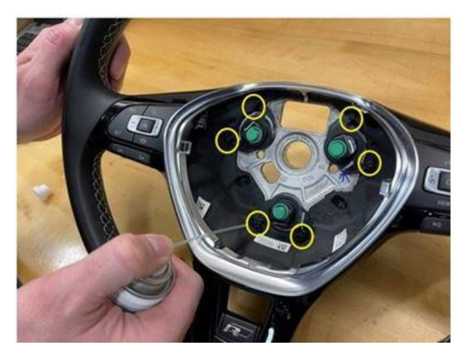
Figure 4: Lubricate spring packs

Apply lubricant G 052 172 M2 to the 6 spring packs on the steering wheel (steering wheel removed for clarity).