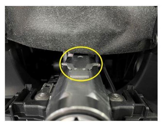
Figure 3: Switch retaining tabs on column

The -J527- must be engaged in the column slots, NOT resting on top of the slots.