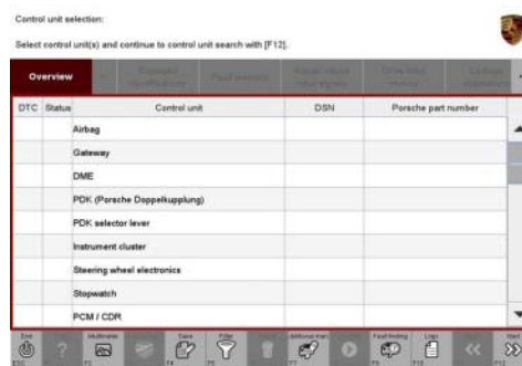
Control unit selection