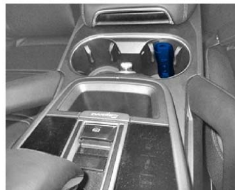
Emergency start tray