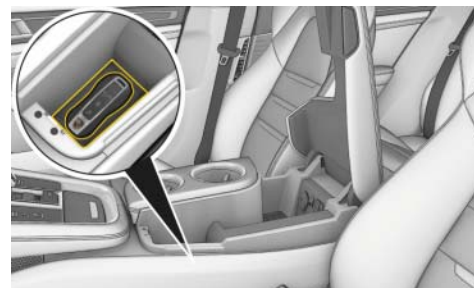
Emergency start tray