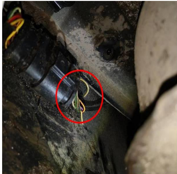
Figure 1. Location to inspect T14m for damage.