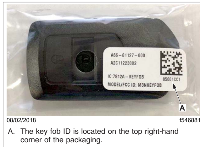
Fig. 1, Key Fob Packaging

If the ID is lost, the fob cannot be paired with a vehicle. The original vehicle Key FOB ID can be located via the DTNA Connect app "Vehicle Information," by entering the last six characters of the VIN and selecting "Vehicle Major Components." See Fig. 2 .