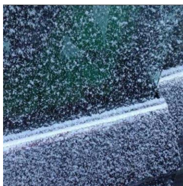
Figure 1. Snow and ice build-up on window and window slot seal surfaces.

If snow and ice collect on the windows and the outer window slot seals, the function that lowers/raises the windows when opening/closing the doors may not operate, even if the window slot seal is of the latest generation. In freezing weather, the window auto-drop function can be blocked by snow and ice building up between the windows and the outer window slot seals (Figure 1).