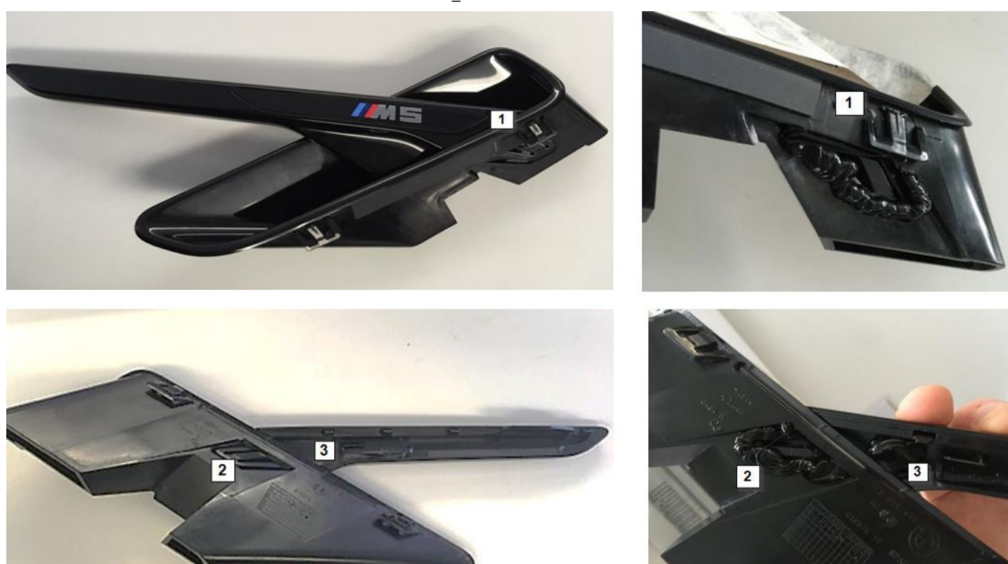
Note: The adhesive at position 3 will be used to bond the air duct cover to the fender. See step 4 for additional instructions for this position.

4. Ensure the adhesive applied at position 3 is thick enough to extend outwards 5mm beyond the clip(4) shown below. This is to ensure adequate bonding to the fender.