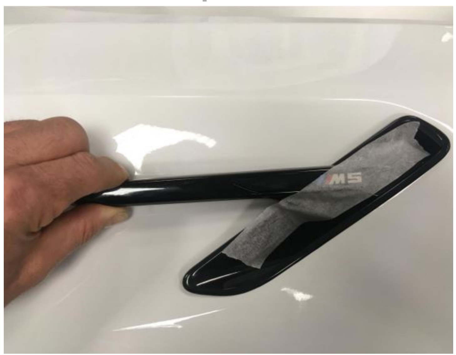
6. After 3 hours, the adhesive tape can be removed. Allow 24 hours of curing time before washing the vehicle.