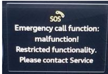
Figure 1. Emergency call malfunction warning.