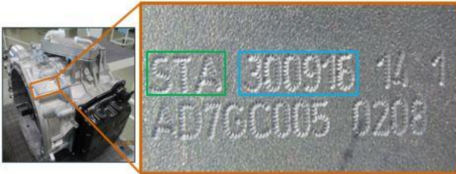
Figure 2. Transmission code and identification.

Audi Technical Assistance Center requires the production date. Once they have the production date and have directed you to perform this TSB, complete the following: