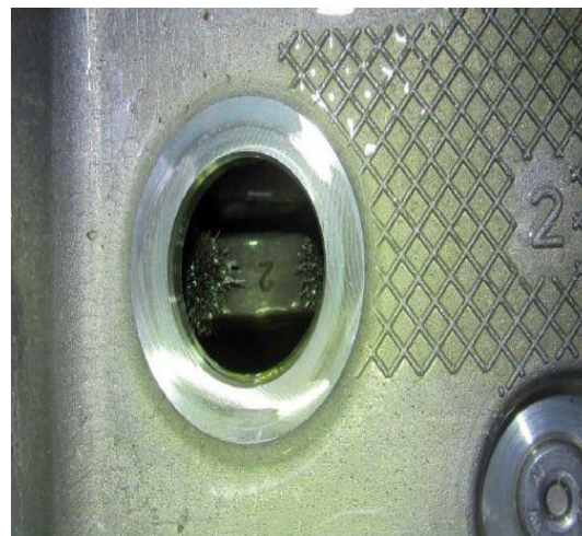
Figure 3. Selector magnet for gear actuator 2/6.