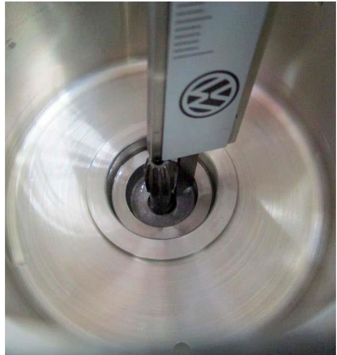
Figure 6. Close-up of the caliper positioning.