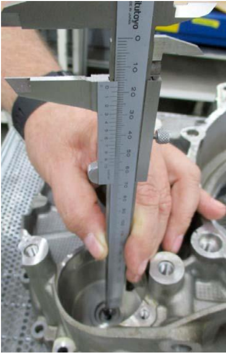
Figure 5. Caliper positioning (transmission removed for pictures).