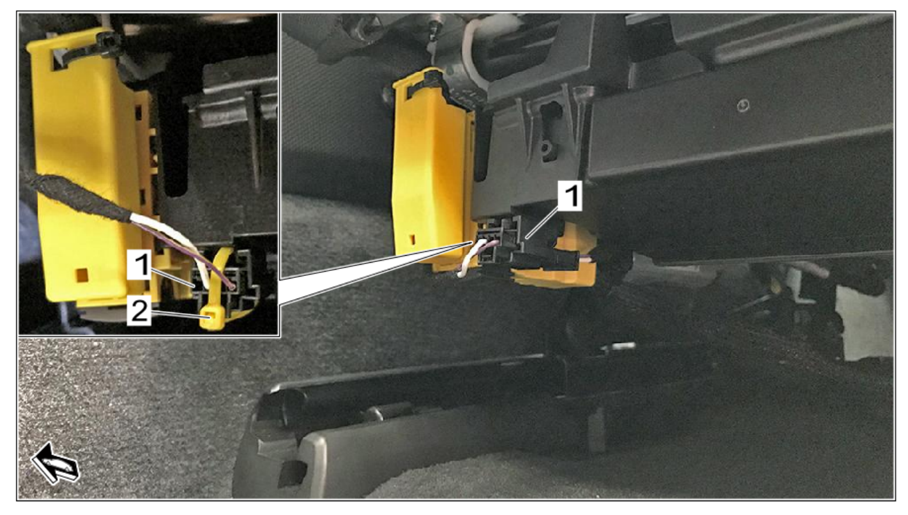
Electric plug connection for front seat ventilation