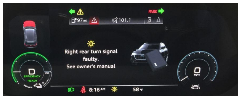
Figure 1. Warning displayed for right rear turn signal.