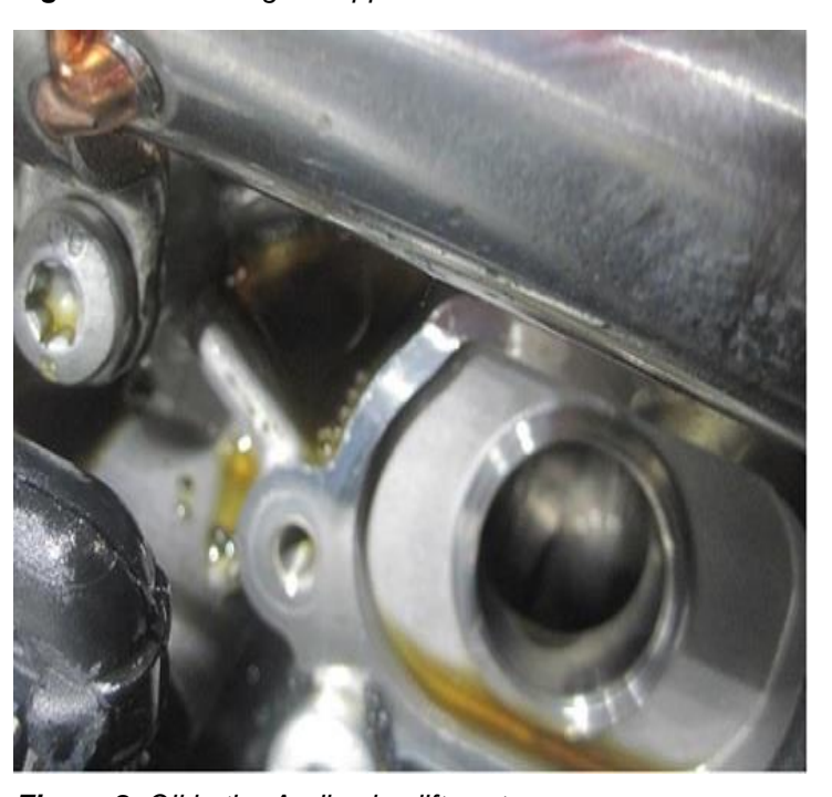
Figure 2. Oil in the Audi valve lift system.