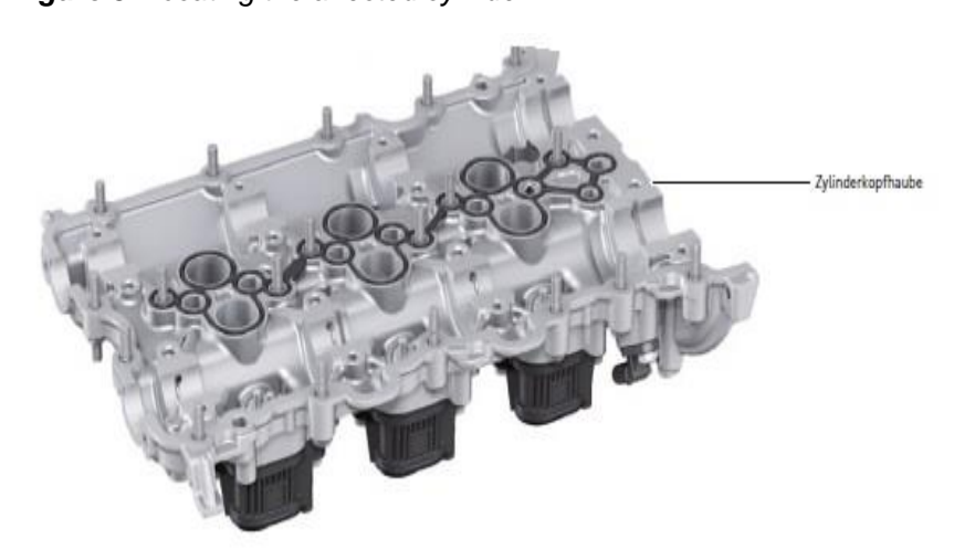
Figure 4. Remove the cylinder head cover and gasket.

6. Remove the cylinder head cover and the seal (Figure 4).