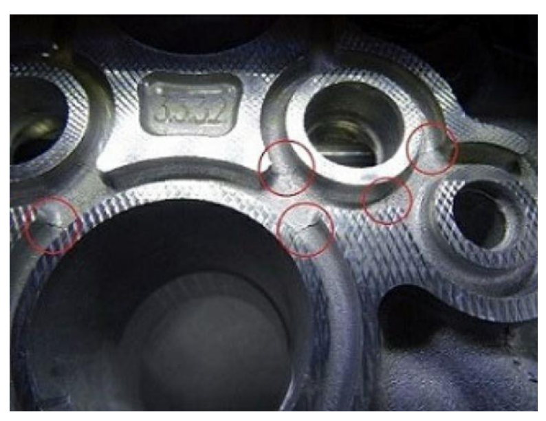
Figure 5. Before the repair.

Make sure not to damage the seal groove!