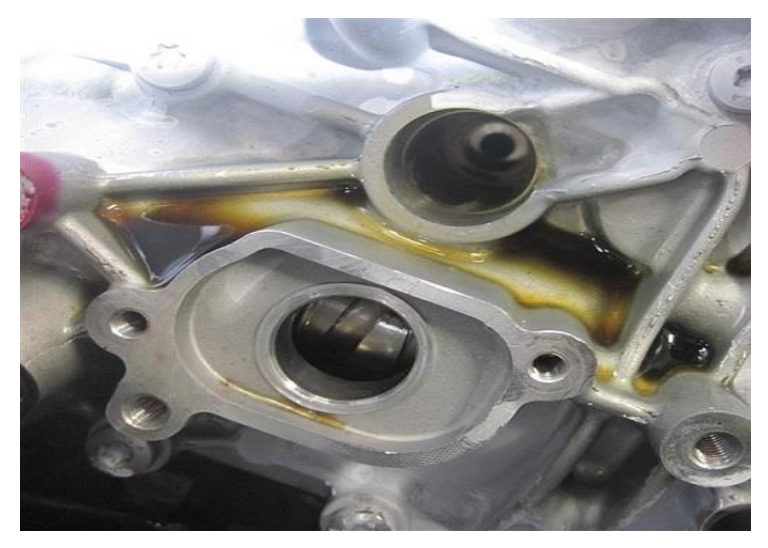
Figure 3. Locating the affected cylinder.

6. Remove the cylinder head cover and the seal (Figure 4).