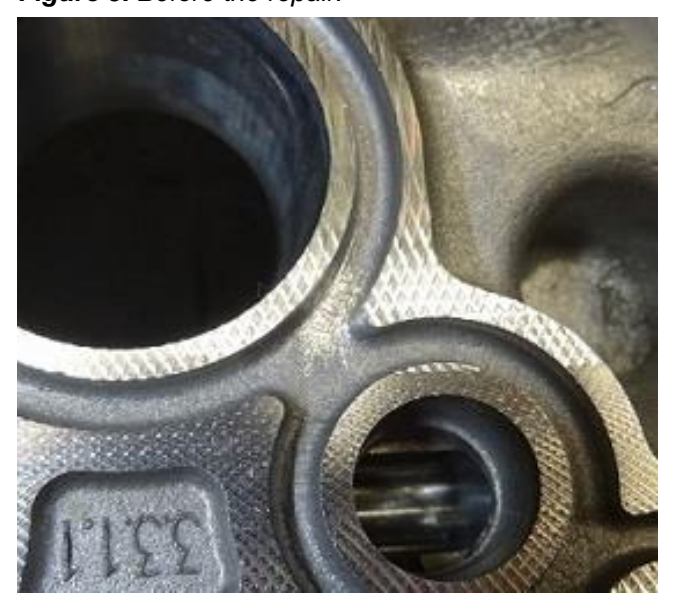
Figure 6. After the repair.

8. Install a new seal, re-assemble the camshaft cover, clean the engine compartment, and if necessary replace the noise insulation (if it is full of oil).