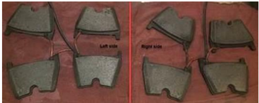
Figure 11. Example of pads without adhesive (mark position for reinstallation if not replaced).