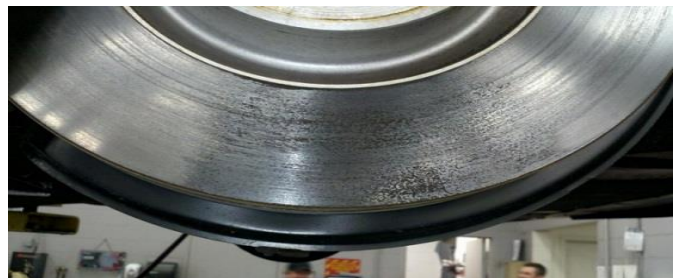
Figure 5. Brake pad material has transferred to the discs.