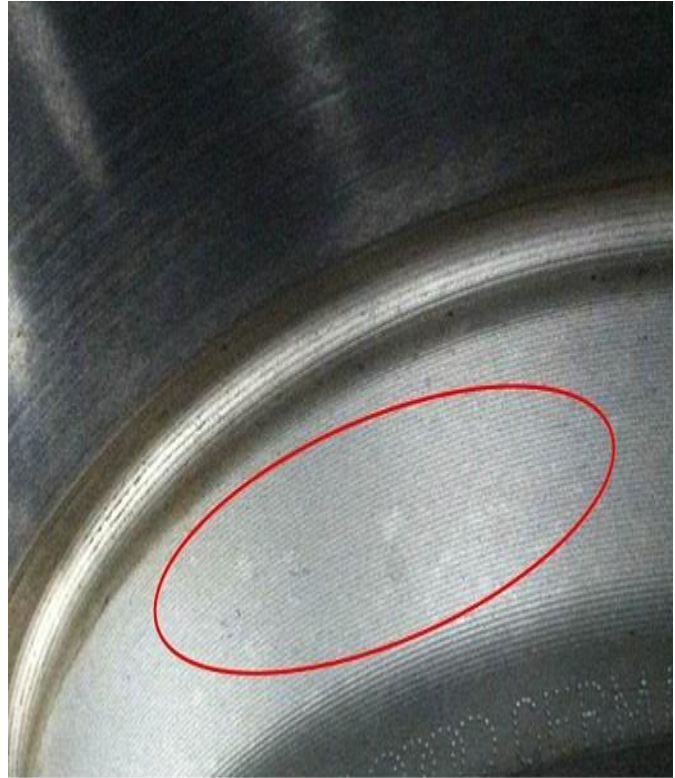
Figure 4. Small spots and discoloration due to chemical contamination from the cleaner that was sprayed directly onto the disc.