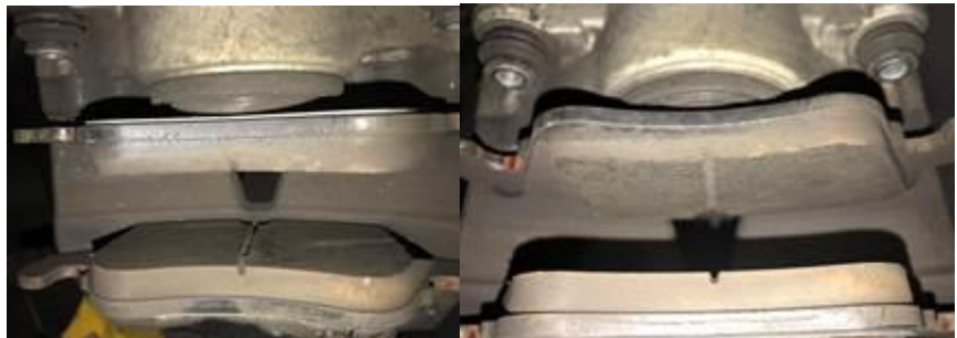
Figure 9 and 10. Example of Inner and outer with an adhesive pad.