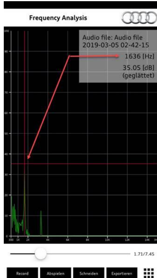
Figure 6. Example of a frequency analysis screenshot.