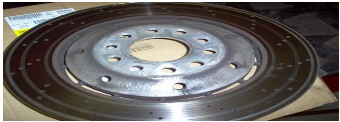
Figure 2. Grooved disc.