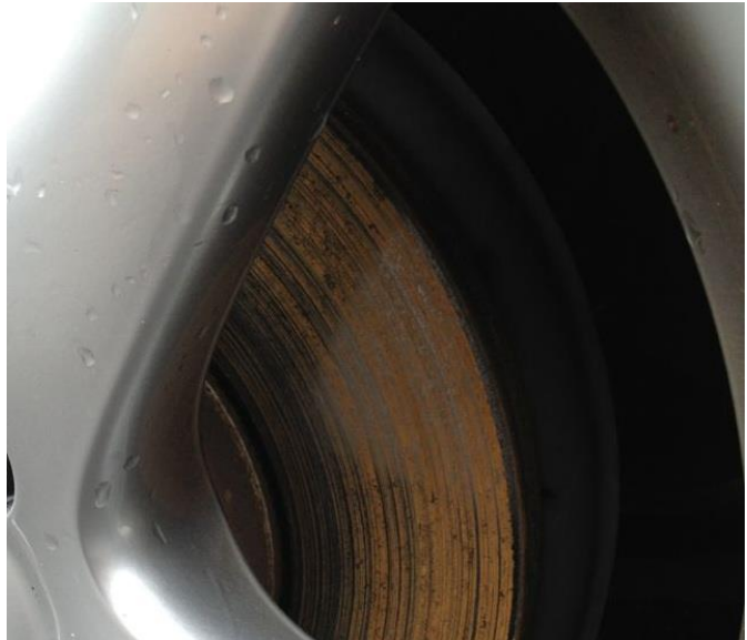
Figure 1. Disc covered with rust.