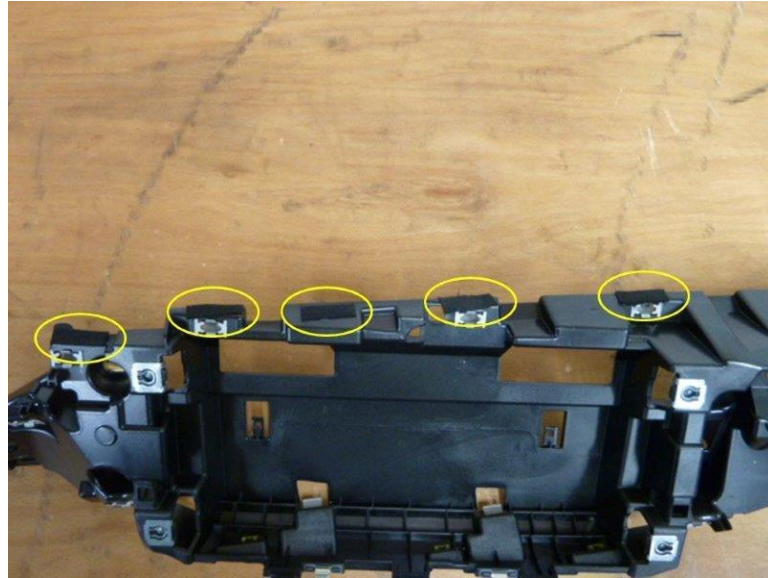
Figure 3. Apply felt strips to the circled areas.