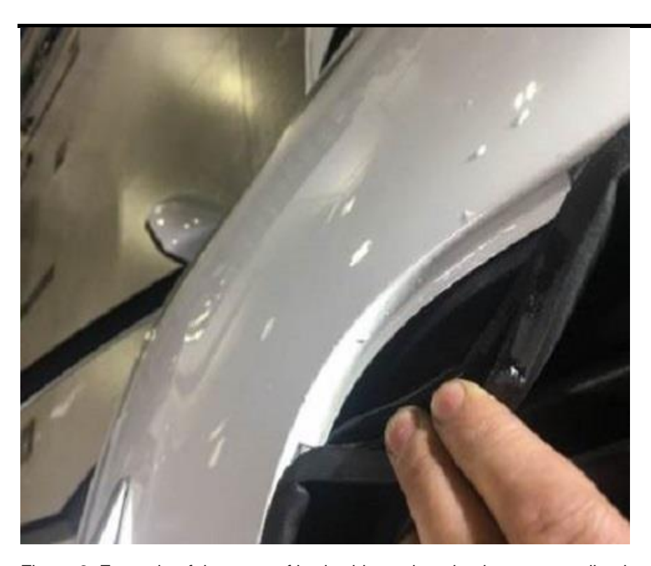
Figure 2: Example of the sunroof body side seal not having proper adhesion to the body.