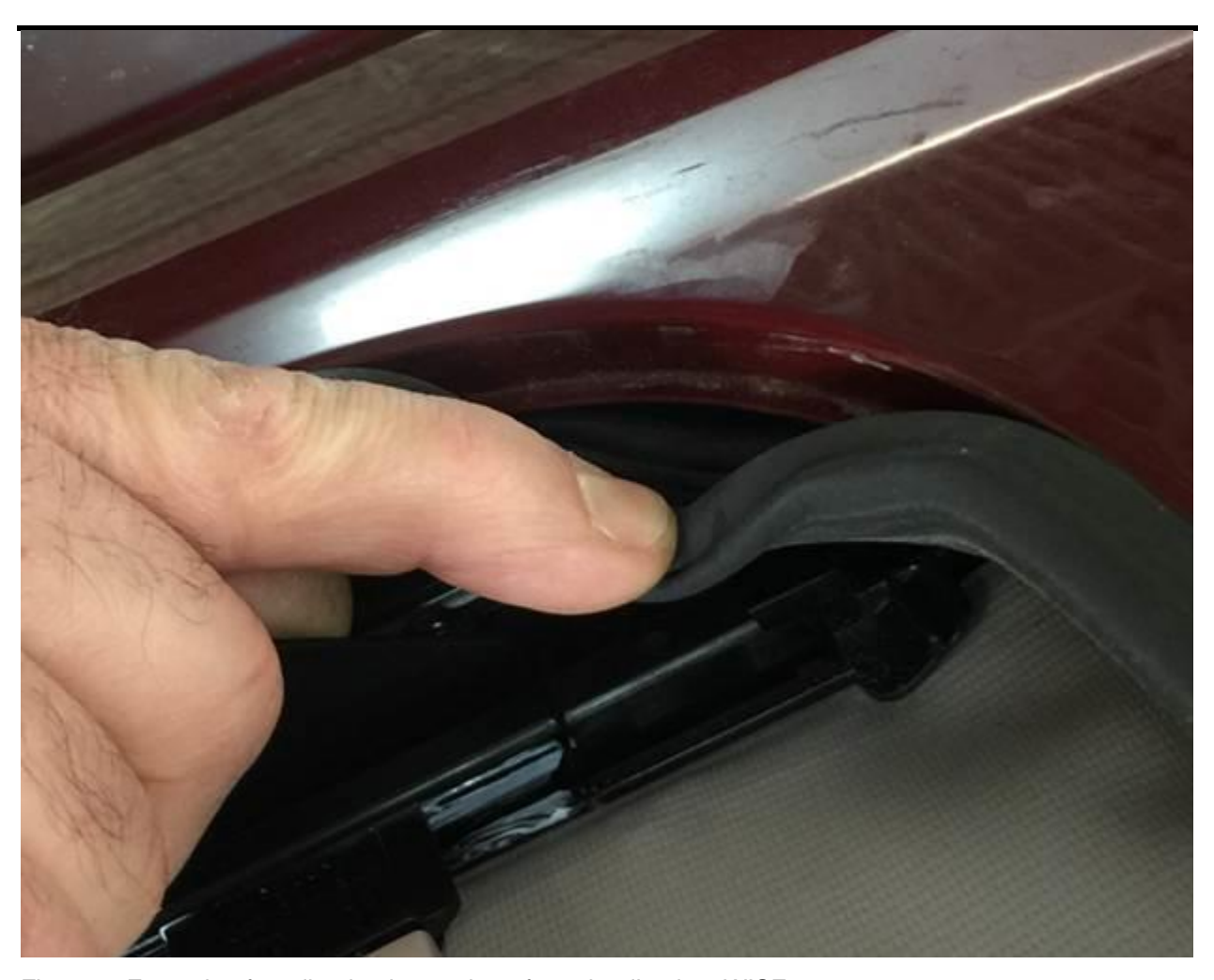
Figure 4: Example of a adhesion issue photo for uploading into WISE.