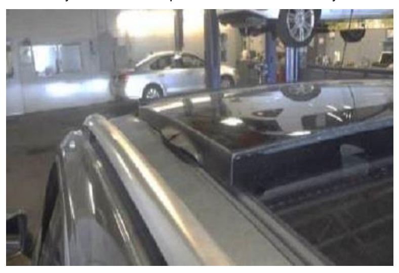
Figure 3: Example of the sunroof panel molded seal warped/deformation.

Visually ensure sunroof panel molded seal and body side seal have no deformation.