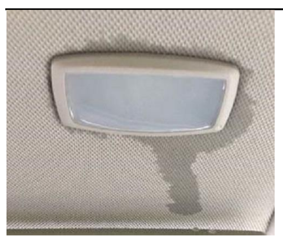
Figure 1: Example of water leak coming from the front vanity light.