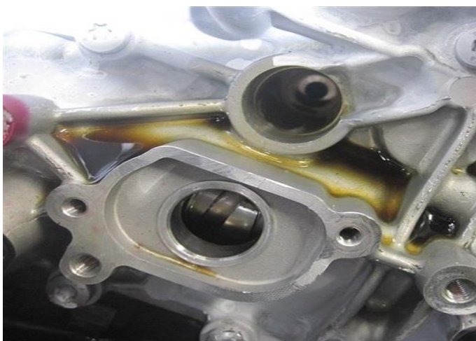
Figure 3. Locating the affected cylinder.