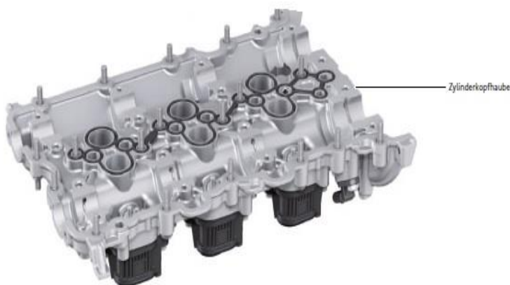
Figure 4. Remove the cylinder head cover and gasket.