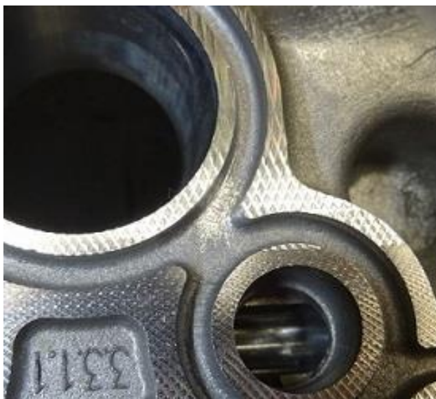
Figure 6. After the repair.