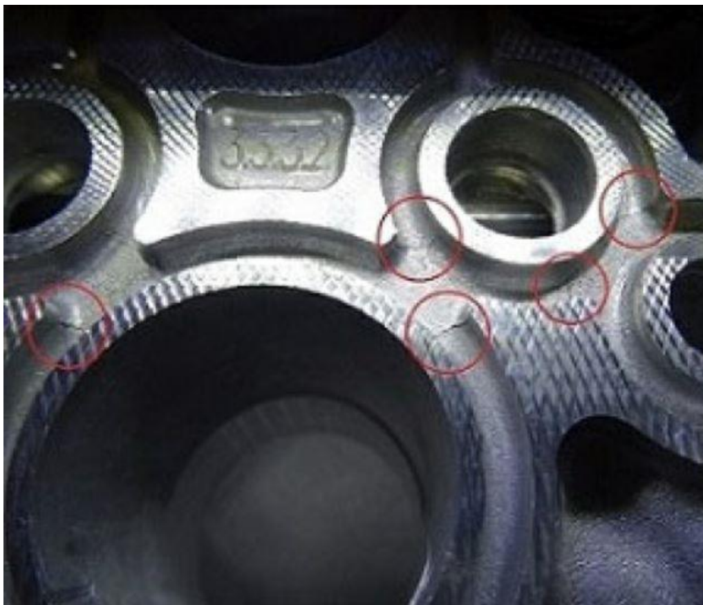
Figure 5. Before the repair.

Make sure not to damage the seal groove!