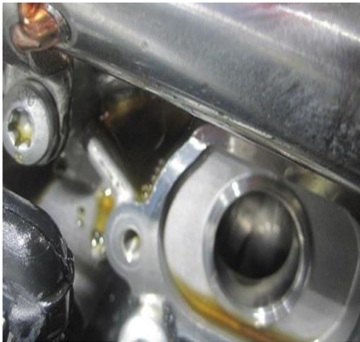
Figure 2. Oil in the Audi valve lift system.