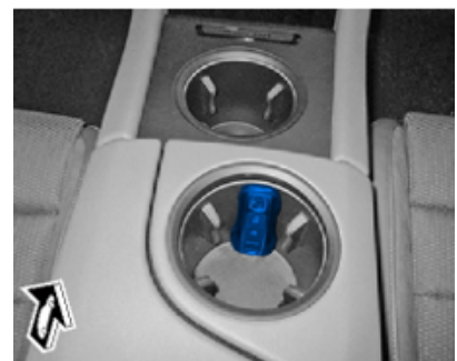
Emergency start tray

5 Establish operational readiness (switch on ignition).