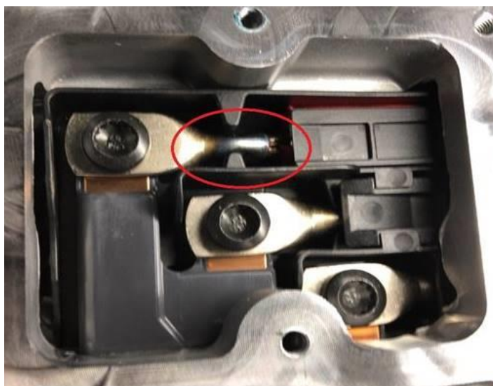
Figure 1. Normal discoloration on terminal.

The dark discolorations in the area of the terminal's round section (Figure 1) are caused by the hot crimping process used in production. They should not be seen as the cause or consequence of a customer concern.