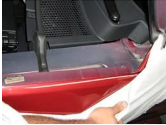
Example 3. Engine Compartment