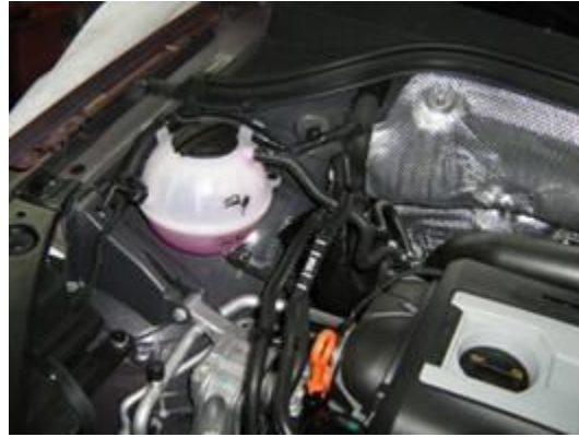
Example 4. Engine Compartment