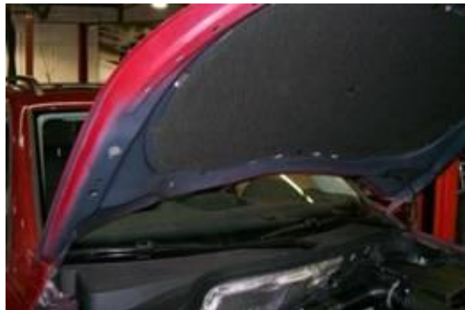
Example 2. Under Hood