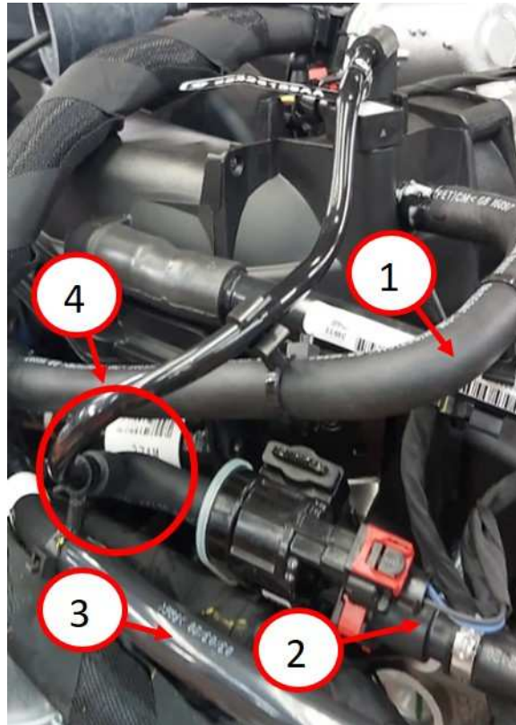
Fig. 1 Kinked Purge Line Elbow