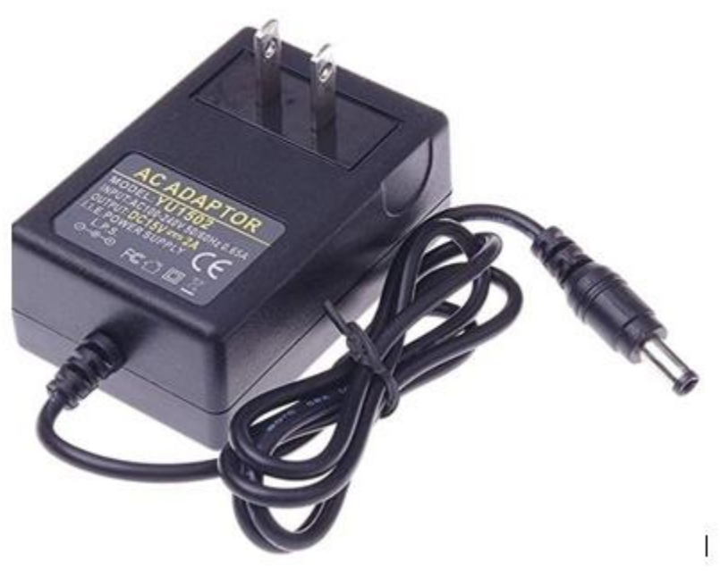
Fig 2. Example of speaker charger. 15V 2Amps

SMAKN AC 100-240V to DC 15V 2A Switching Power Supply Converter Adapter US Plug (6.5Ft) by SMAKN