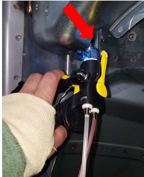
Fig. 3 Applying The Foam To The Cavity

4. Apply foam sealant for around eight seconds or until the cavity is full (Fig. 3) .