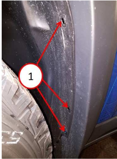
Fig. 1 Rear Push Pins Removed