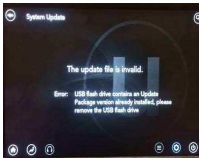
Fig. 4 Rear Seatback Video Screen Error

NOTE: If the USB flash drive is left in the port after system reboot, there will be a pop-up on the rear seat back video screen that states "The update file is invalid" (Fig. 4). This is not a concern as the system is already up to date.