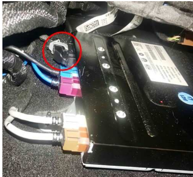
Fig. 2 VRM Harness Connector