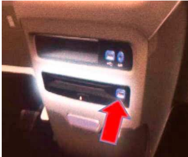
Fig. 3 Correct USB Port