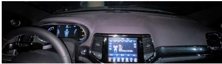
Fig. 2 Entire Width Of IP Cover For Claim Submittal

NOTE: A new steering wheel bolt must be used for the Repair Procedure.