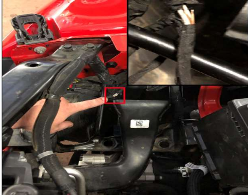
Fig 2, suspect harness stretch area.

This document does not authorize warranty repairs. This communication documents a record of past experiences. STAR Online does not provide any conclusions about what is wrong with the vehicle. Rather, it captures all previous cases known that appear to be similar or related to the vehicle symptom / condition. You are the expert, and you are responsible for deciding on the appropriate course of action.