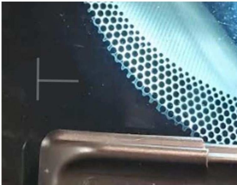
Fig. 2 Wiper Blade Alignment T Mark