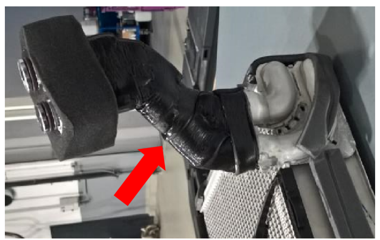
Then reassess the noise.